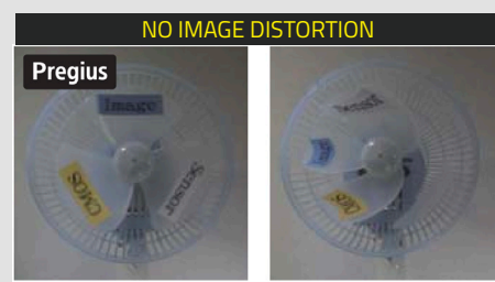
Global shutter Rolling shutter